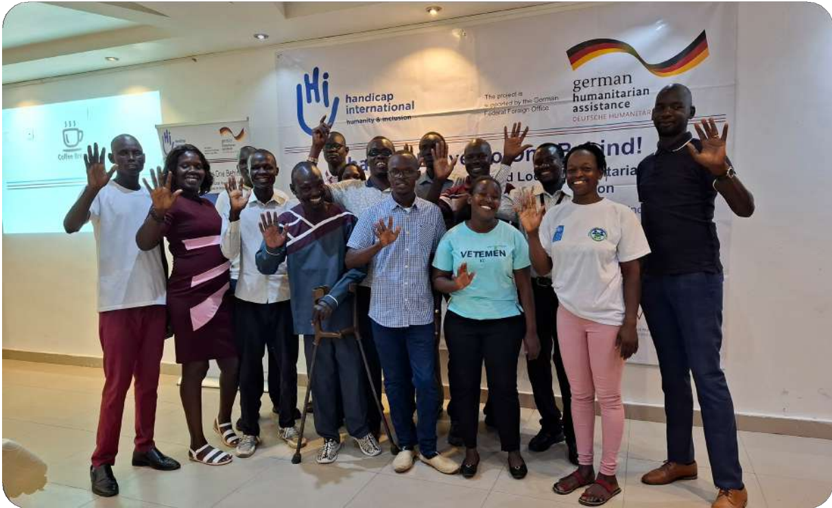
Description: Technical Support members (inclusion focal points) posed for group photos during Training of Trainers (ToT) at Juba Regency Hotel, South Sudan (2024).

OPDs have voiced concerns about their marginal role in HPC, increasingly viewing their involvement as merely symbolic. They are often invited to project inaugurations to present an image of inclusivity rather than to participate in meaningful decision-making. Furthermore, many OPDs criticize training sessions – mostly on capacity-building – as repetitive, seeing them as ‘tick-box exercises’ that deliver few tangible benefits in terms of capacity-building or empowerment.